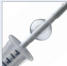
Spec+ Medical Balloons