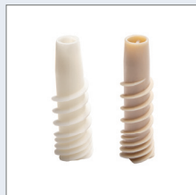
Spec+ Bioresorbable Components