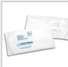
Spec+ Tyvek® Packaging