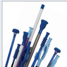
Spec+ Additive Manufacturing