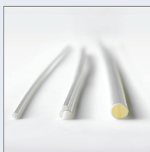
Spec+ PEEK Components