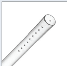
Spec+ Laser Processing